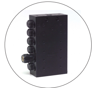
Distribution Valve With Cycle Indicator Pin